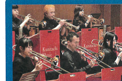
Students interested in becoming professional musicians may enroll in the Department of Pro Music. Here, they can learn musical improvisation in many different formats, including big band and jazz sessions.

KMA's three core principles are "freedom, creativity, and independence", embodied in the academy's motto: "unconditional freedom of mind". On the basis of these ideas, KMA has forged a one-of-a-kind instructional system, unlike that found in any standard school or college of music, in which the students can choose any classes of their preference regardless of the faculty administering them. It would be fair to conclude that Kunitachi Music Academy has fostered a truly extraordinary learning environment that permits individuals to challenge their full potential and transform their passion for music into lifelong careers.