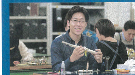
Along with the Department of Music Therapy, the course in wind instrument repair also enjoys great popularity. KMA is distinctive for teaching its students to both repair and play the instruments with which they are working.

Kunitachi Music Academy Address: 3-28-8, Ikejiri, Setagaya-Ku, Tokyo, Japan 154-0001 See our HP: https://www.kma.co.jp (Japanese only) e-mail: contact@kma.co.jp