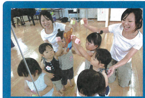
KMA's regular course to train instructors in infant eurhythmics was the first of its kind in Japan. Classrooms have opened across Japan to support the career aspirations of its graduates.

In addition, Kunitachi Music Academy has been involved in music therapy for senior citizens from an early date, having established its Department of Music Therapy in 1995. There are two types of music therapy: receptive